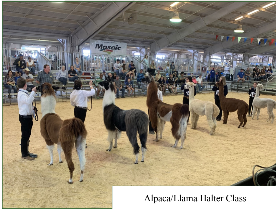
Alpaca/Llama Halter Class