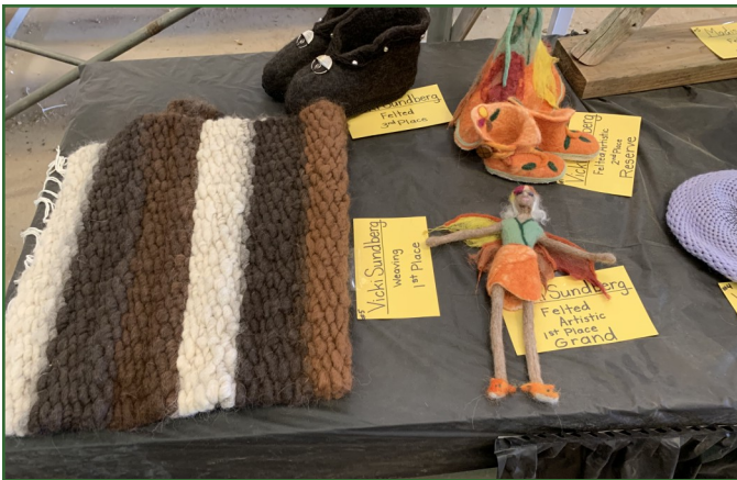
Finished Products Display — Adult