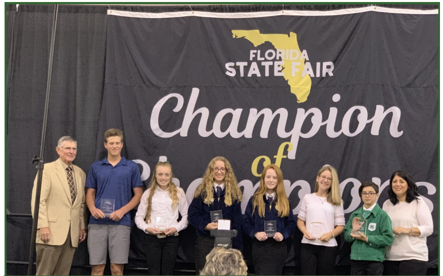
2019 Champions Onstage